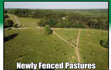
Newly Fenced Pastures

1850 MOUNT PLEASANT RD • PAMPLIN, VA (APPOMATTOX CO.)