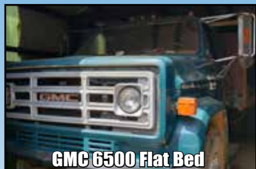
GMC 6500 Flat Bed