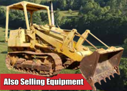
Also Selling Equipment