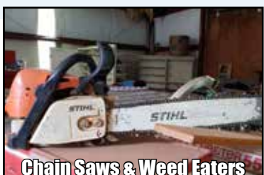
Chain Saws & Weed Eaters