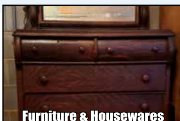
Furniture & Housewares