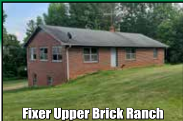
Fixer Upper Brick Ranch