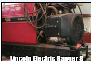
Lincoln Electric Ranger 8