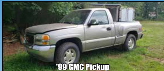
'99 GMC Pickup