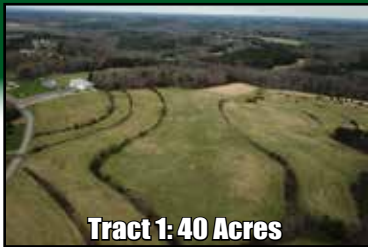
Tract 1: 40 Acres