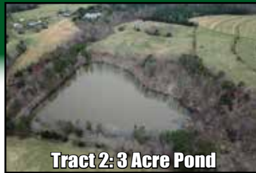
Tract 2: 3 Acre Pond