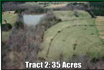
Tract 2: 35 Acres