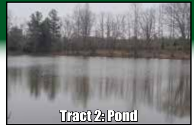
Tract 2: Pond