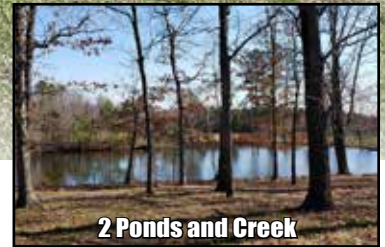
2 Ponds and Creek

SALE SITE: RESIDENCE INN MARRIOTT • 2630 WARDS RD • LYNCHBURG, VA