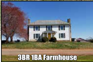
3BR 1BA Farmhouse