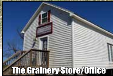
The Grainery Store/Office