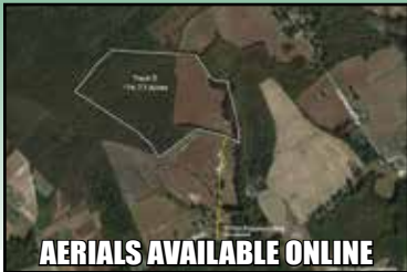
AERIALS AVAILABLE ONLINE