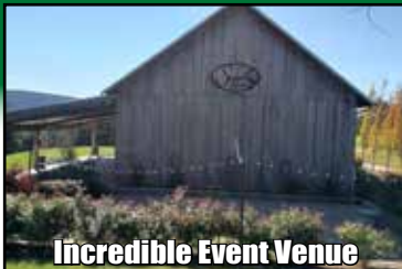
Incredible Event Venue