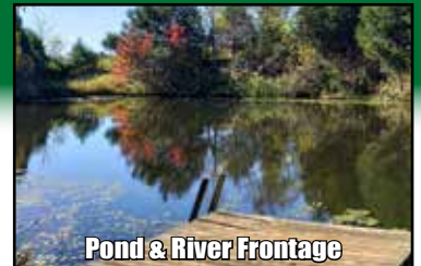
Pond & River Frontage