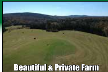
Beautiful & Private Farm