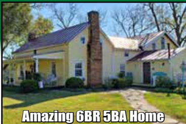
Amazing 6BR 5BA Home