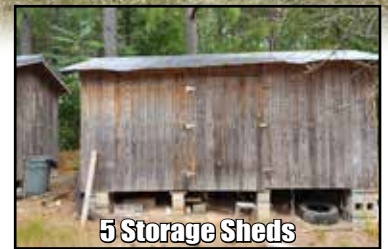
5 Storage Sheds

5925 LEESVILLE RD ▸ LYNCH STATION, VA (CAMPBELL CO.)