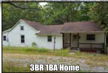
3BR 1BA Home