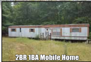
2BR 1BA Mobile Home